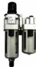
Filter-Regulator & Lubricator (FR+L)