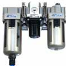
Filter Regulator Lubricator (FRL)

If you have not installed a FRL (Air Treatment System) in your air supply system, we like to recommend that you install one to protect your air tools and other air-powered equipment. Air Treatment System can ensure longer and trouble-free operations for air products.