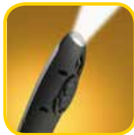
Magnetic base & hook