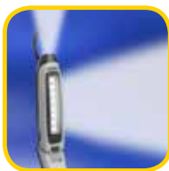
Dual light source