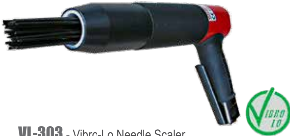
VL-303 - Vibro-Lo Needle Scaler

Trelawny Surface Preparation Technology is a market leader in the design, manufacture and supply of a comprehensive range of critical surface preparation tools and equipment. Specially designed for efficient removal of paint, rust and coating from steel and concrete surfaces. An ISO-9001 accredited company established for over 60 years.