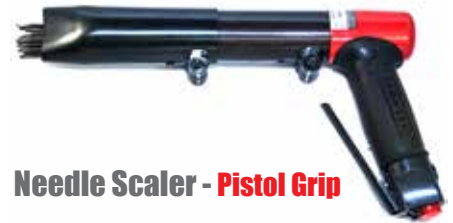
Needle Scaler - Pistol Grip