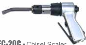
AFC-20C - Chisel Scaler