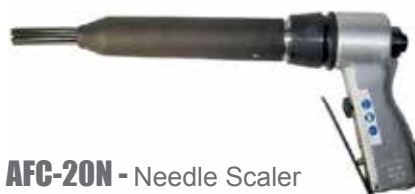
AFC-20N - Needle Scaler