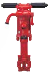
TJ-15LBS - 14.0kg