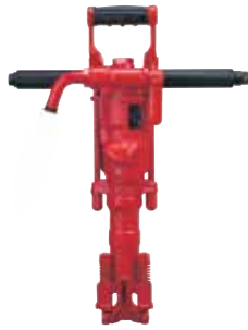
TJ-20LBS - 18.5kg