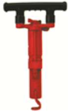
TH-5S - 5.8kg