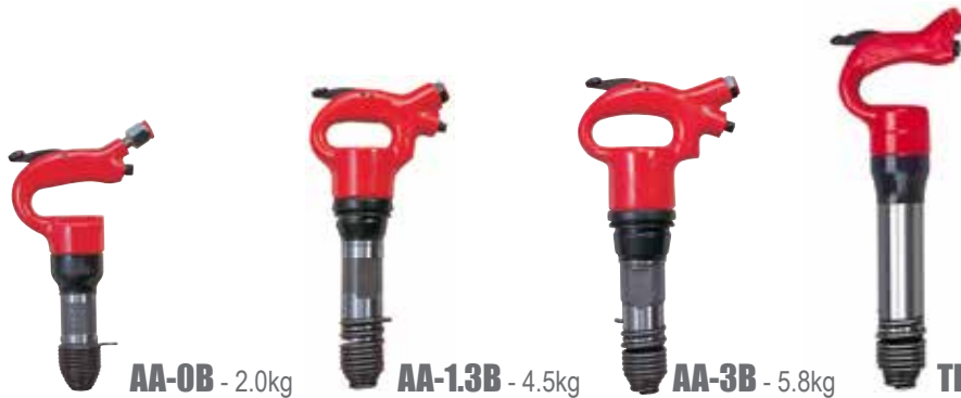
AA-0B - 2.0kg