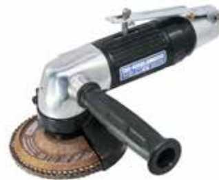
TAG-40SML - Safety Lever Throttle (M10 Male Thread) TAG-40SAL - Safety Lever Throttle (Female Thread)