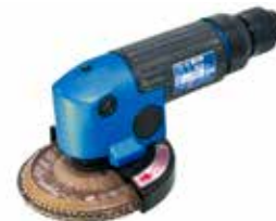
TAG-40FR - 4" Angle Grinder Roll Throttle (Female Thread) TAG-40MR - 4" Angle Grinder Roll Throttle (Male Thread)