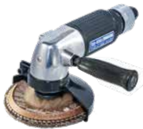
TAG-40SA - 4" Angle Grinder Roll Throttle