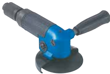
TAG-40FRH - Side Handle & Roll Throttle TAG-40FLH - Side Handle & Lever Throttle