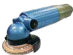
TAG-20NR - 2" Angle Grinder Safety Roll Throttle