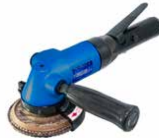
TAG-400 - 4" Angle Grinder Safety Roll Throttle TAG-400QJL - 4" Angle Grinder Safety Lever Throttle